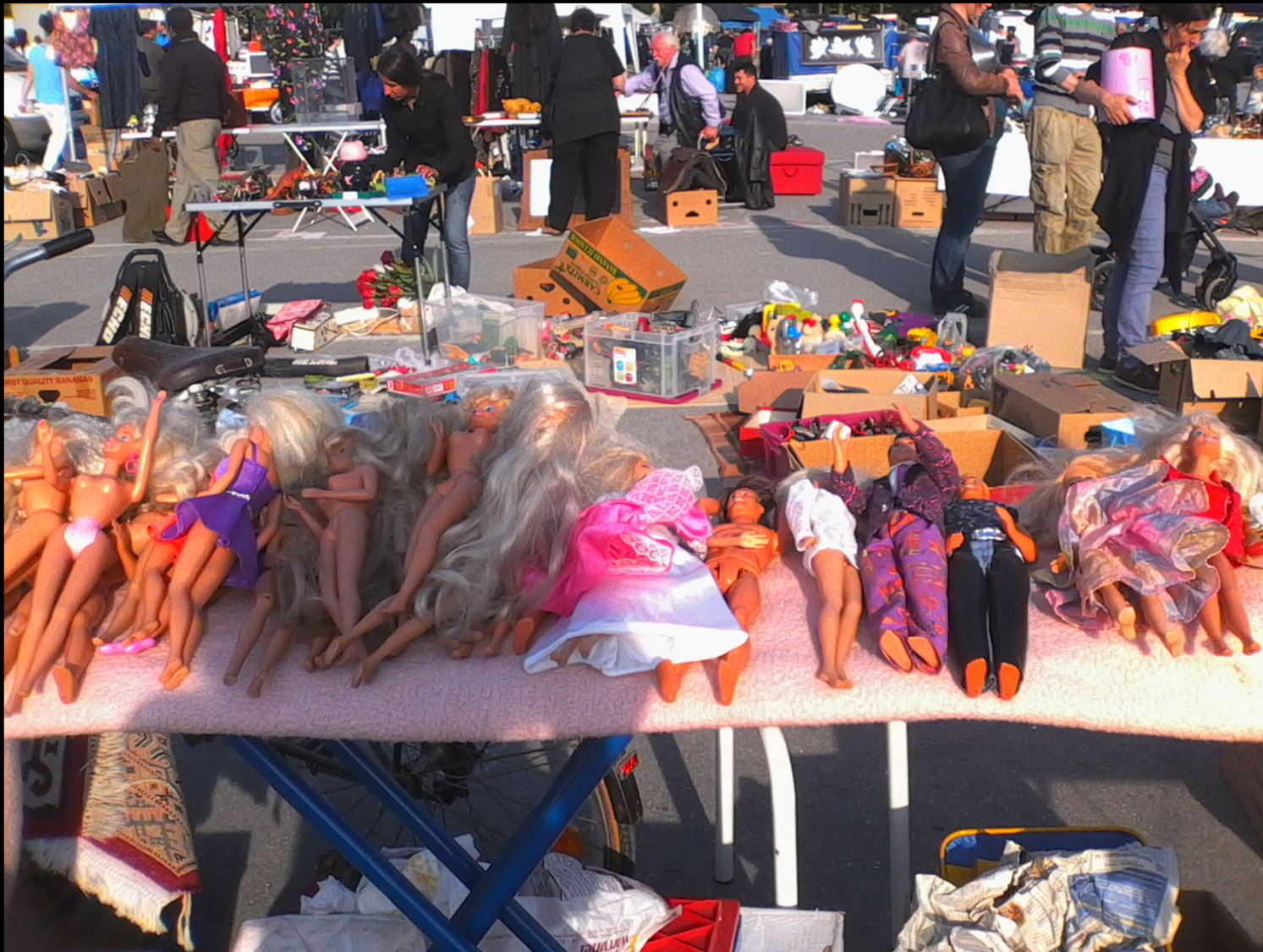
Otera, Alba. Matthias-Pschorr-Straße 1, München. 26.04.14