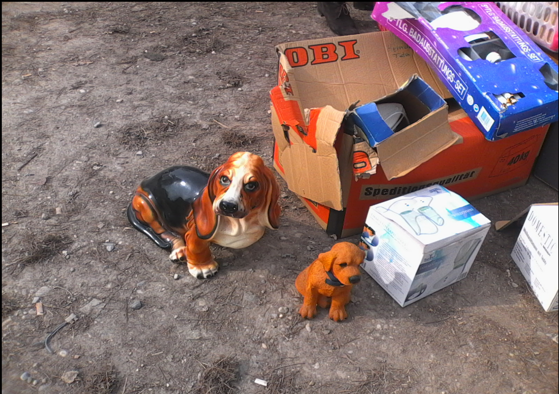
Otera, Alba. Matthias-Pschorr-Straße 1, München. 26.04.14