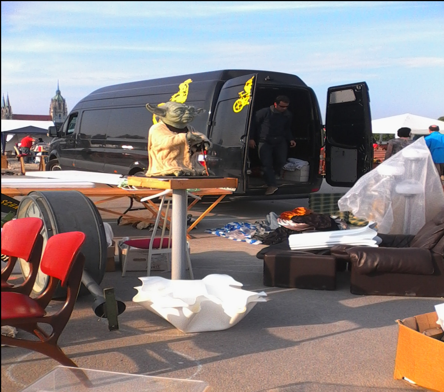
Otera, Alba. Matthias-Pschorr-Straße 1, München. 26.04.14